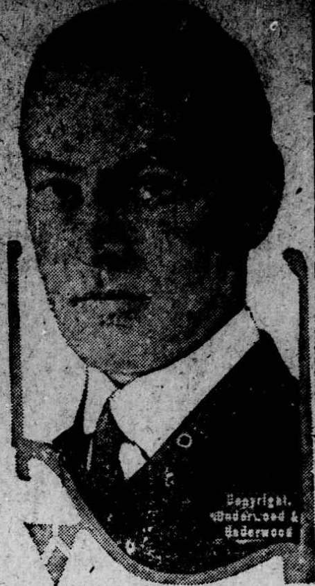
LIEUT. COMMANDER KING. Lieut. Commander E. U. King, royal navy, is assistant naval attaché of the British embassy at Washington.

The increased cost of the various materials and appliances used in the operation of the railways is well illustrated by the two signal towers shown herewith, which are located on the main line of the Southern Railway, sixteen miles south of Washington. These two towers are part of the electric automatic block signal system, protecting the double-tracked line of the Southern Railway System between Washington and Atlanta. Installation of these towers was completed May 15, 1914, at a cost of $3,207.00. To install two similar towers in 1920 would cost $5,000.00.