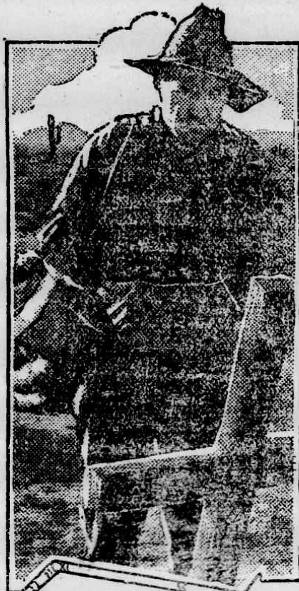
Harry Carey in "SUNDOWN SLIM" UNIVERSAL AUDITORIUM Saturday, Jan. 29.

The first snow - fall, to amount to anything in the past three years, fell on Wednesday night of this week. A depth of about 10 inches was reached. The snow is as soft as downy pillows are, but not quite so comfort. Many rabbits have been unlucky victims because the snow largely checks the fleetness of their speed in escaping the hunter and his gun and dog.