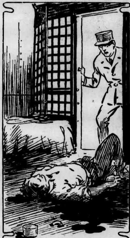
Lay in a Widening Pool of Blood.