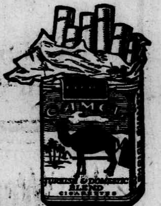
R. J. REYNOLDS Tobacco Co. Winston-Salem, N. C.

Give Camels a tryout. Buy a pack today. Get your information first hand. You'll tie to Camels, too.