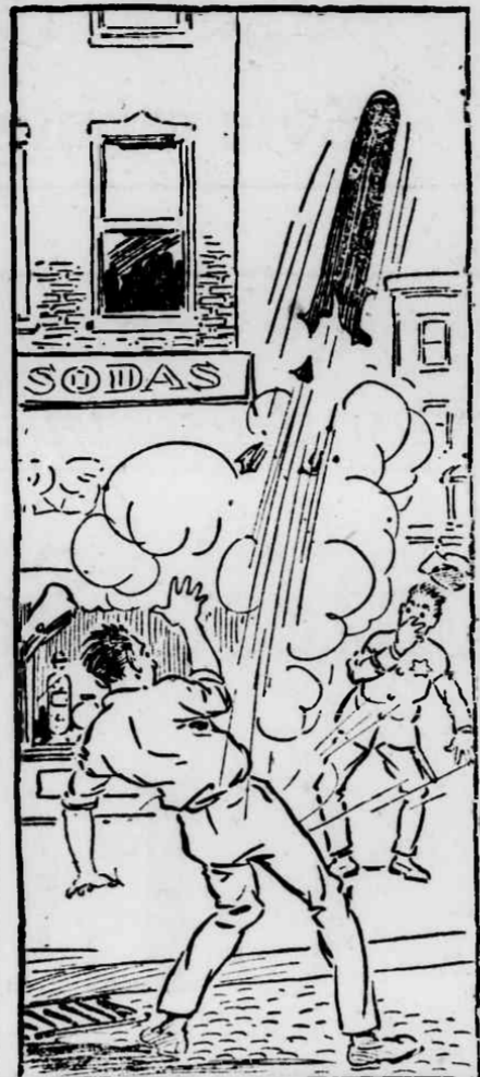
Twisting, Whirling and Shooting Upwards.

At precisely that moment Policeman Finger's words were drowned in an