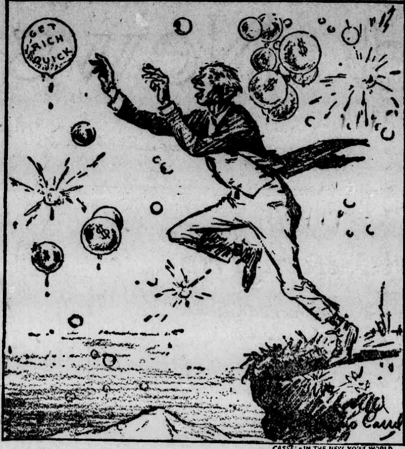
CASSELL—IN THE NEW YORK WORLD