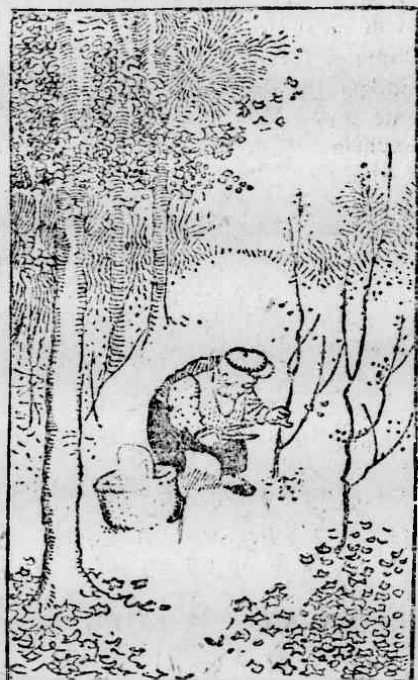
"I Shall Begin to Gather."

"It means, that I am going into the manufacture of witchhazel. I have all for bruises and contusions. Do you