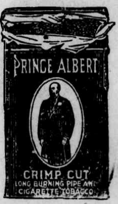
Copyright 1921 by R. J. Reynolds Tobacco Co. Winston-Salem N. C.

Prince Albert is a revelation in a makin's cigarette! My, but how that delightful flavor makes a dent! And, how it does answer that harkering! Prince Albert rolls easy and stays put because it is crimped cut. And, say—oh, go on and get the papers or a pipe! Do it right now!