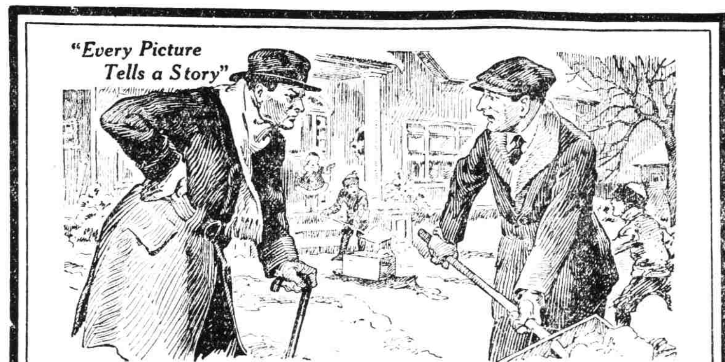
"Every Picture Tells a Story"

We must retire inward if we would ascend upward.—St. Bernard.