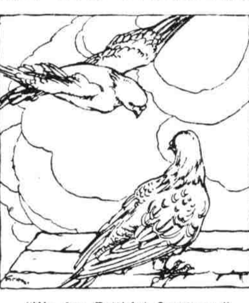
"We Are Faithful Creatures."

"We can see all the old familiar places," said the first Homing Pigeon.