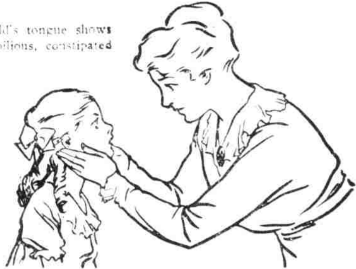
Child's tongue shows if bilious, constipated

you a bottle of Dodson's Liver Tone for a few cents under my personal money-back guarantee. Each spoonful will clean your sluggish liver better than a dose of nasty calomel and that it won't make you sick. Dodson's Liver Tone is real liver medicine. You'll know it next morning because you will wake up feeling fine, your liver will be working, your headache and dizziness gone, your stomach will be sweet and your bowels regular. You will feel like working; you'll be cheerful; full of vigor and audacity. Dodson's Liver Tone is entirely vegetable, therefore harmless and can not salivate. Give it to your children.