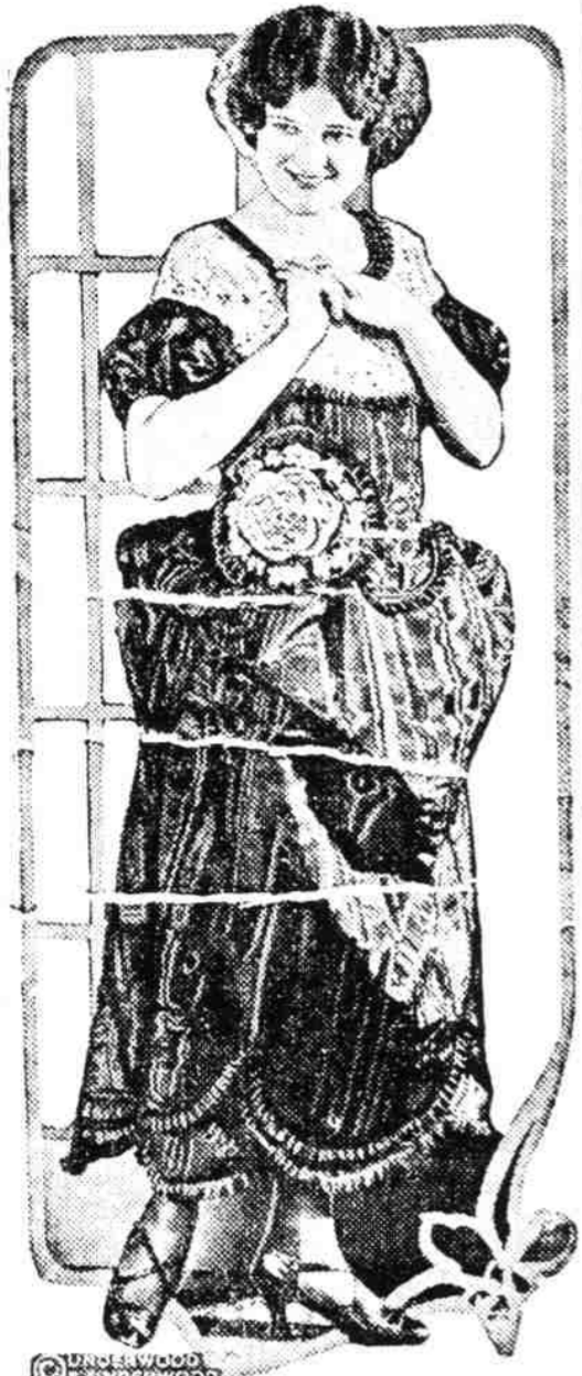
Here is a chic spring frock made of moire taffeta with venice lace yoke. It is trimmed with plaited ribbon and a colonial bouquet of pastel shades.