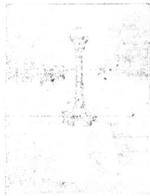
The Street Signal Has the Three Lights, Red, Yellow and Green, and Two Additional Smaller Red Lights Near the Crossings to Indicate a Railway Crossing.

The city has adopted a signal with three lights, which differs from other signs.