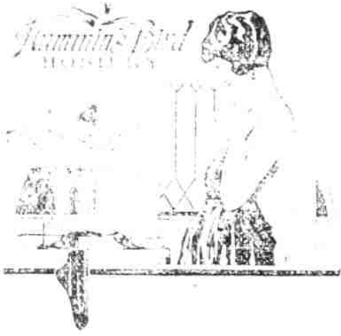
Miss Carrie Bethea

A silk stocking whose wear is measured by months instead of days.