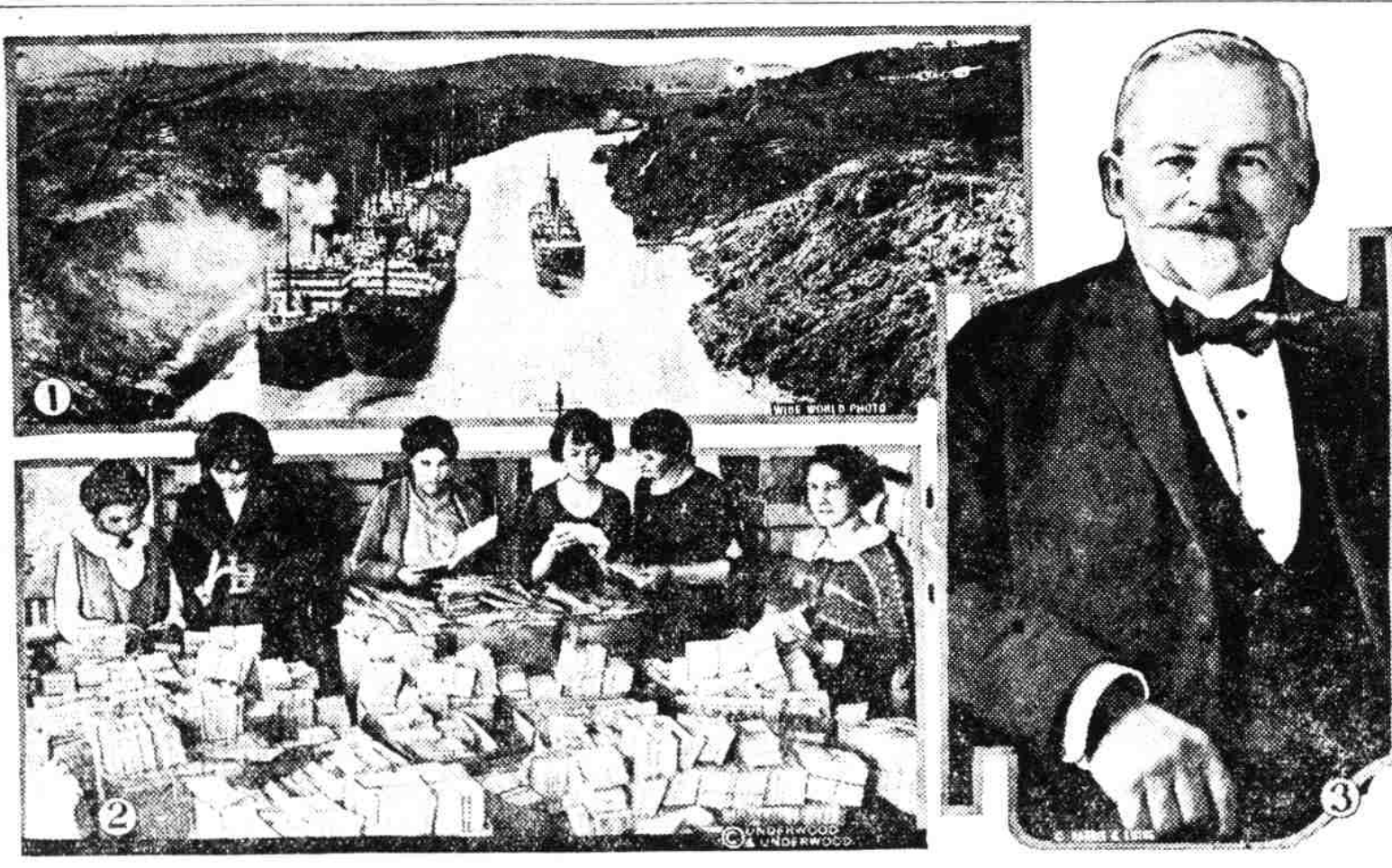
1-Southbound steamers in Pannan canal acid up by sline in Conflard cut while northbound vessels are proceeding. 2 Department of Agriculture sierks making an estimate of the country's pig population from reports from the farmers. 3-New photograph of Emil Cone, noted expenent of cure by nuto-suggestion, w.o. will return to America in January.