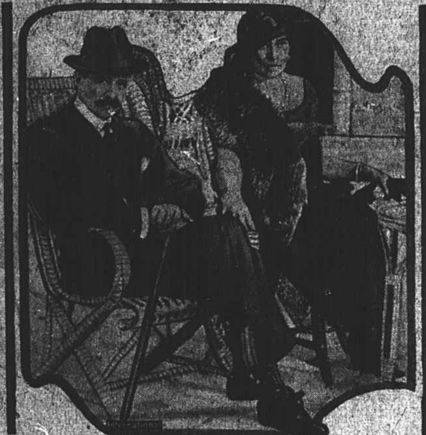
At a family council of the surviving Romanoffs, held in Paris, it was agreed that the Grand Duke Cyril should be recognized as the legitimate claimant to the Russian throne.