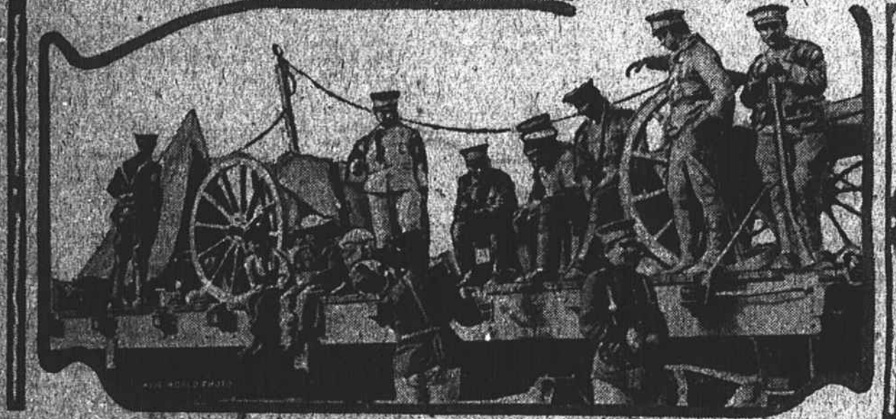
Artillery of the federal Mexican army entraining for the successful attack on the revolutionists at Puebla.