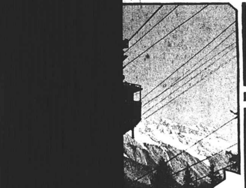
Switzerland will be able to ride from the sides of that mountain on a new cable car passenger car on its trial trip.