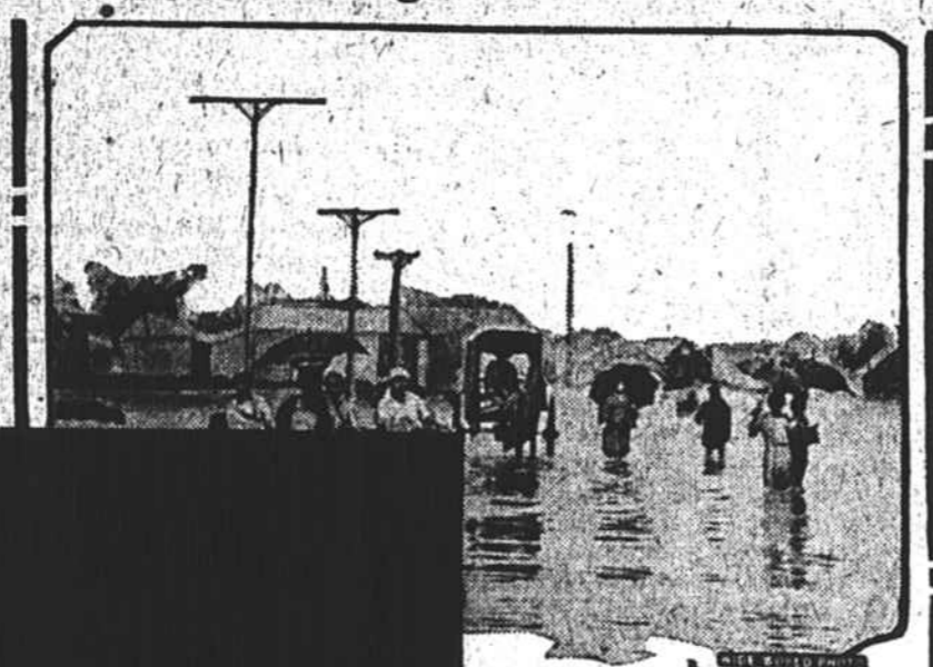
Manila, I., has been suffering from floods this week. The street shown here is a main avenue when the waters were high.