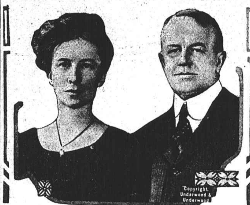
Mr. and Mrs. Frank B. Gilbreth of Montclair, N. J., and New York, who have just been appointed delegates to the scientific management congress to be held at the Masaryk Academy of Labor in Prague, Czechoslovakia, July 21-25. News has just reached this country of the election of Major Gilbreth to the Masaryk Academy of Labor, the highest scientific honor within the gift of the progressive new republic. Mrs. Gilbreth is one of the two engineers who have been elected to honorary membership in the American Society of Industrial Engineers.