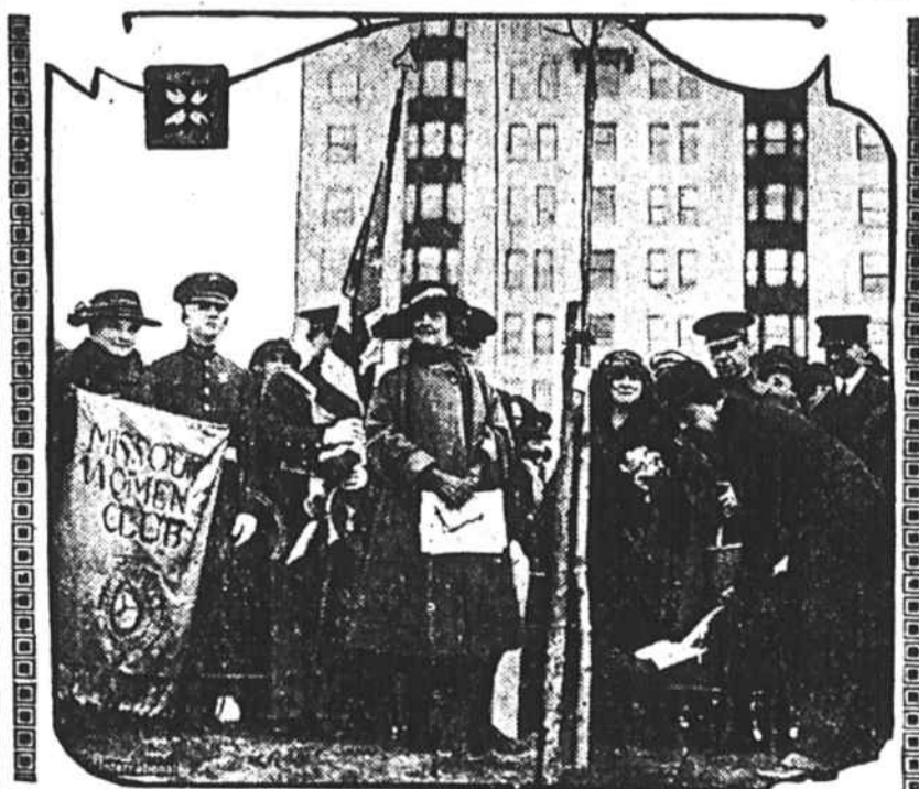
Rupert Hughes, the well-known author, planting a tree in memory of Mark Twain in Memorial grove, facing Grant's tomb on Riverside drive, New York, on behalf of the Missouri Women's Club of New York. The tree was brought from Mark Twain park, Florida, Mo., where the famous humorist was born.