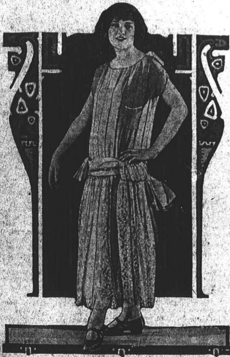
Ideal for Afternoon Formal Occasions.

expectation, but it is making a record for itself. It takes two to produce the picture, namely the scarf itself and the wearer thereof. It would, indeed, be presumption on the part of any dictator to attempt to coach a lady on the art of wearing the scarf. She has the situation well in hand. It is an inborn gift, a knack, a matter of feminine intuition, this wielding of the scarf about fair shoulders with a