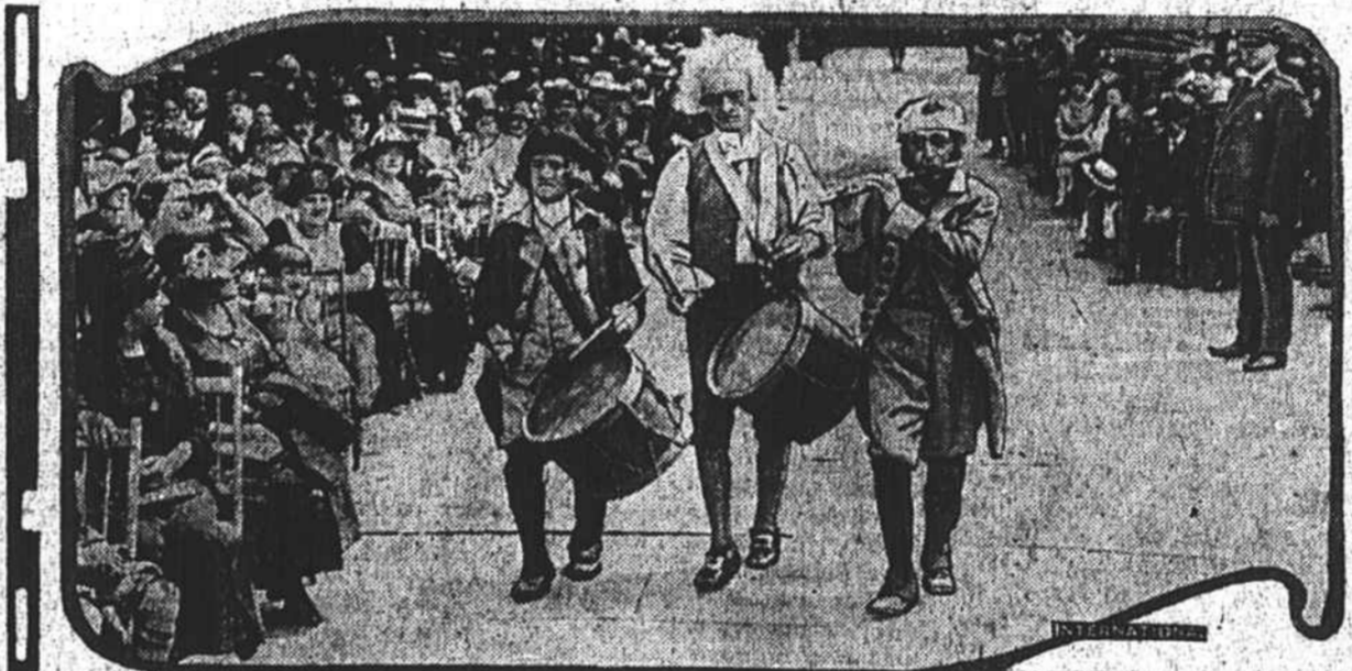
Thousands of Philadelphians gathered in Independence square to rally to the cause of the Sesqui-centennial celebration. Uniformed hosts of 50 organizations paraded the streets of the city to the center of patriotic demonstration at the shrine of Liberty.