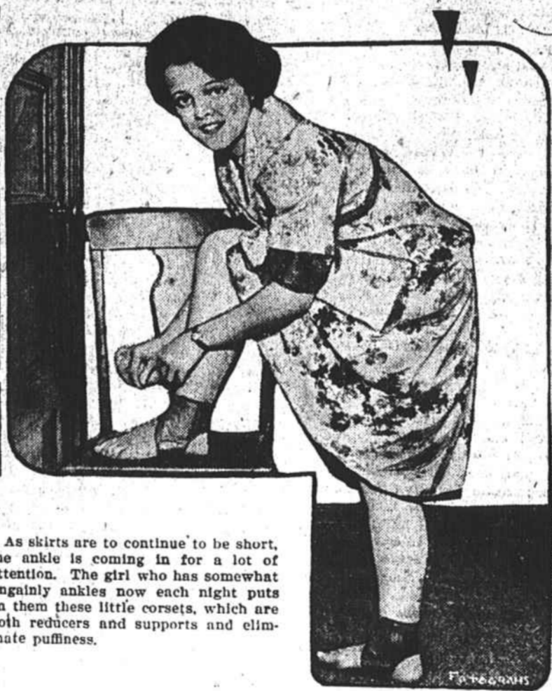
As skirts are to continue to be short, the ankle is coming in for a lot of attention. The girl who has somewhat ungainly ankles now each night puts on them these little corsets, which are both reducers and supports and eliminate puffiness.