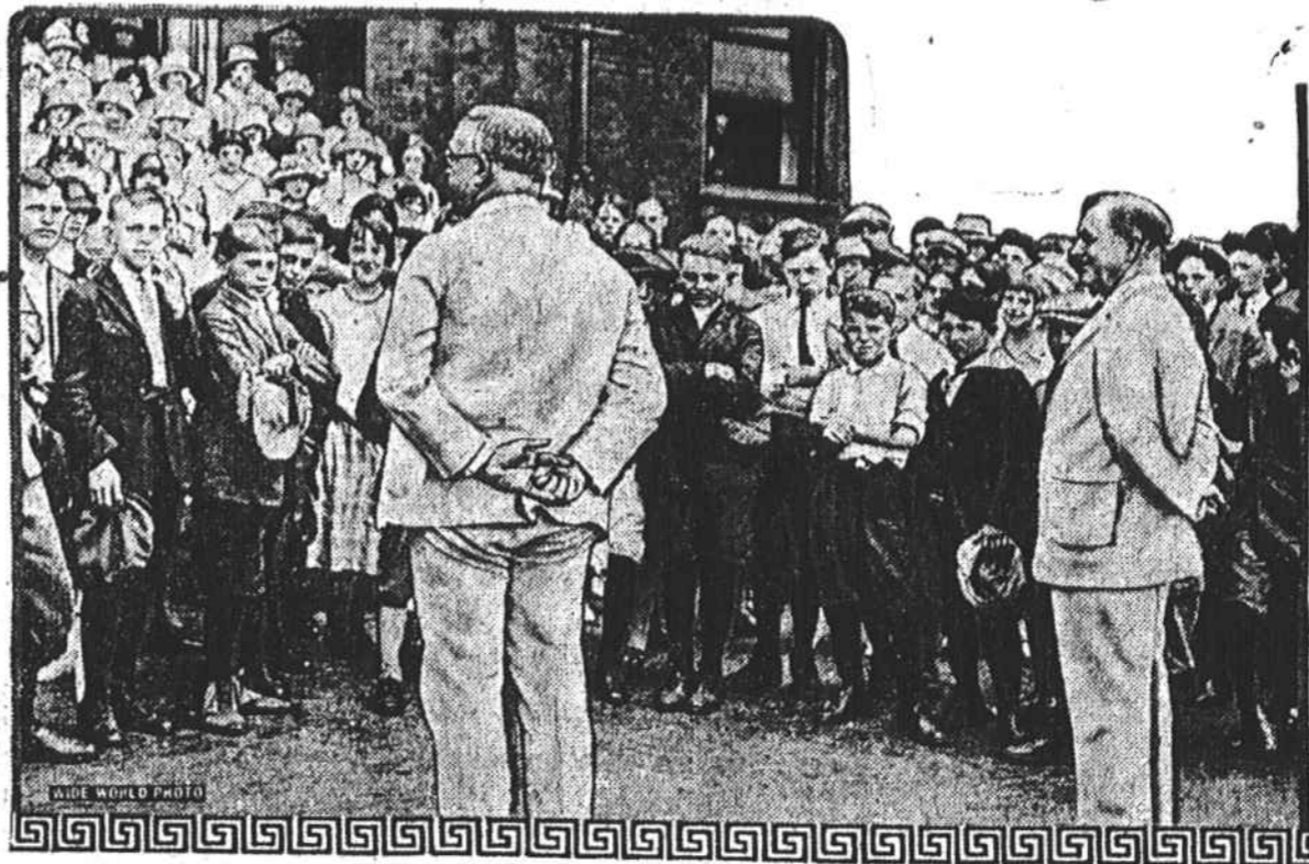
A group of 300 boys and girls who are attending the University of Maryland for a summer farm course being addressed by Secretary of Agriculture Wallace at the Agriculture department.