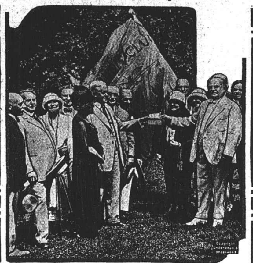
Members of the Iroquois club of Chicago at Clarksburg, W. Va., making John W. Davis, Democratic Presidential nominee, an honorary member of the organization. He is the eighth man to be so honored.