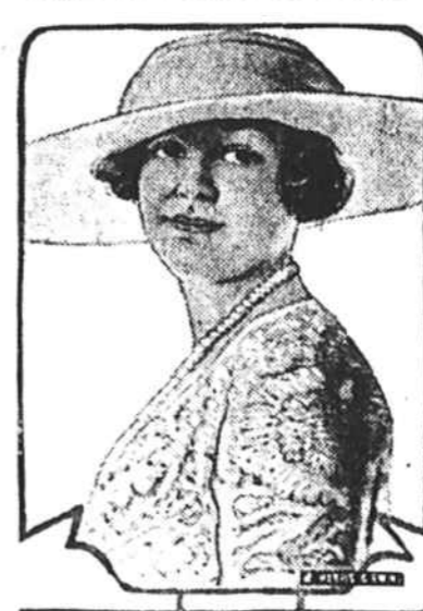
Mrs. Douglas McArthur, wife of General McArthur, has just been appointed a special officer of the Manila police force. Her first arrest was of a Filipino accused of beating his horse.