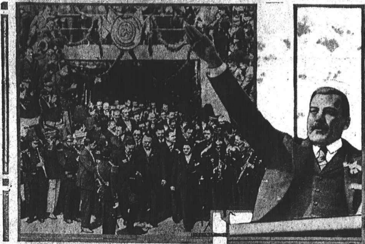
General Obregon and General Calles entering the stadium in Mexico City for the inauguration of the latter as President of the republic. At the right General Calles taking the oath of office.