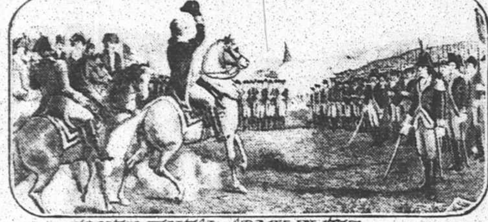
CONTINENTAL ARMY IN 1775