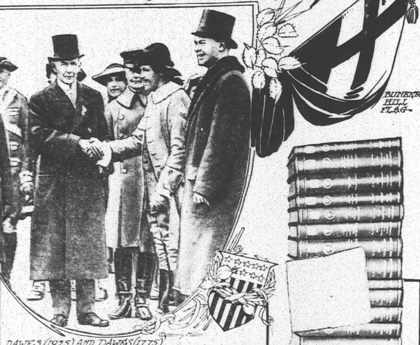
DAWES (1925) AND DAWES (1775)