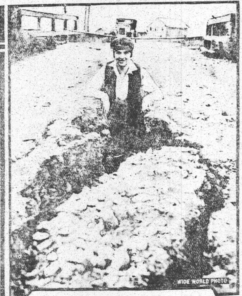
Huge fissures, several feet deep, appeared in the earth's surface near Three Forks, Mont., opened by the severe earthquakes. The crevice shown here was 100 feet long, 2 to 5 feet wide and 2 to 8 feet deep.