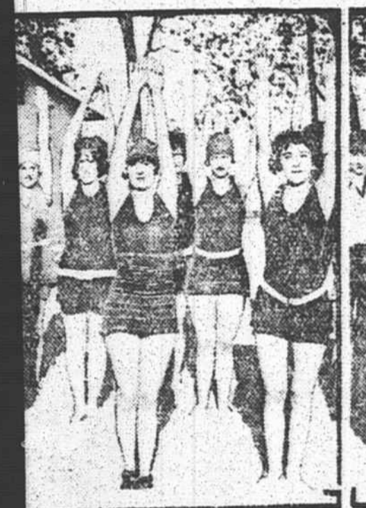
has started a free class in physical culture. Any young lady who is free of cost. She needs only to working on the bench.