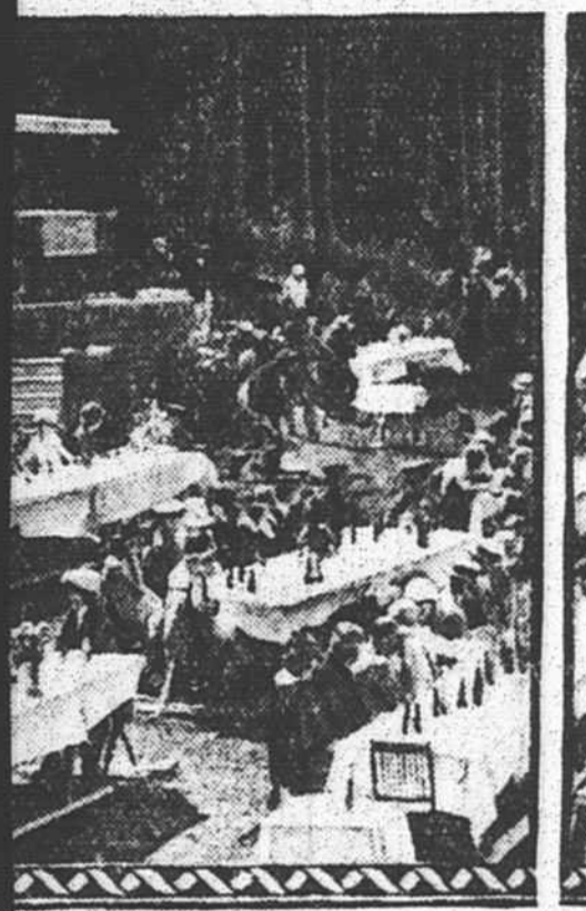
Their convention in Bar Harbor, Maine, men enjoying their Pot and Kettle club.