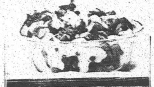
Beaten Into Mayonnaise Dressing.

Prepared by the United States Department of Agriculture. The creamiest, not much of the product, of the average high school or college girl for dishes dressed up with whipped cream. As a matter of fact, whipped cream is not merely a garnish but a valuable food when the berries to appear frequently in the menu points out the United States Department of Agriculture.