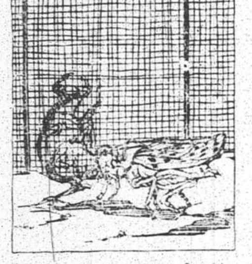
He Did Not Mind Being Stupid.

"It's a matter of pride to me," said Mr. Beetle. "Yes, it is a matter of great pride to me. Anyone in my position would be proud, too."