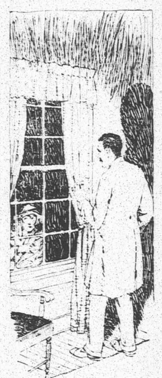
The Light Fell Full Upon a Face Close to a Window Pane.

Reverend Sage had moved over to one of the windows, while the other occupants of the room surrounded Baxter, and was guzing out between the curtains across the gale-swept porch; into the blackness beyond. He shivered a little, poor chap, at the thought-