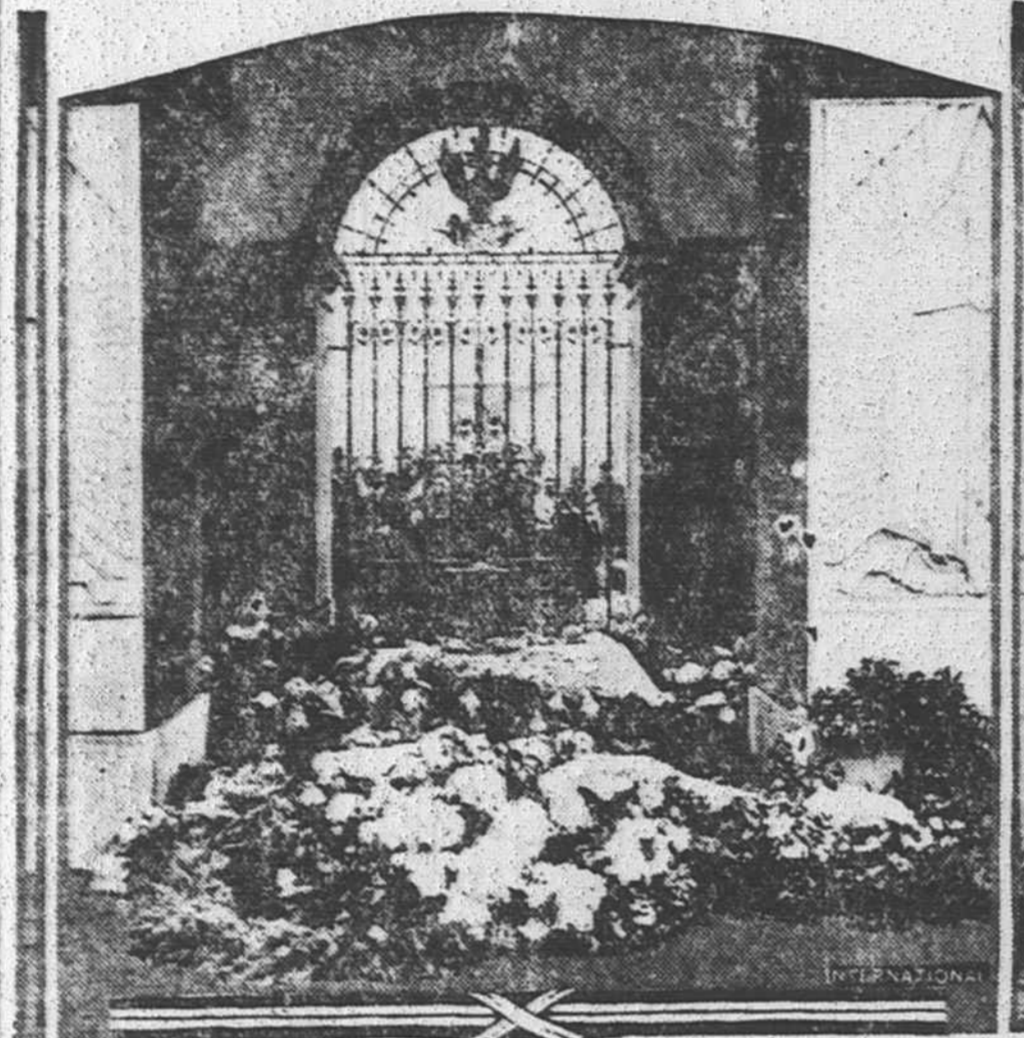
The tomb of the Unknown Soldier of Poland in Warsaw, covered with floral offerings just after the ceremonies attending the burial of the soldier took place. The President of the Polish republic and other high officials took part in the ceremonies. The body of the soldier was exhumed in a battlefield near Lemburg.