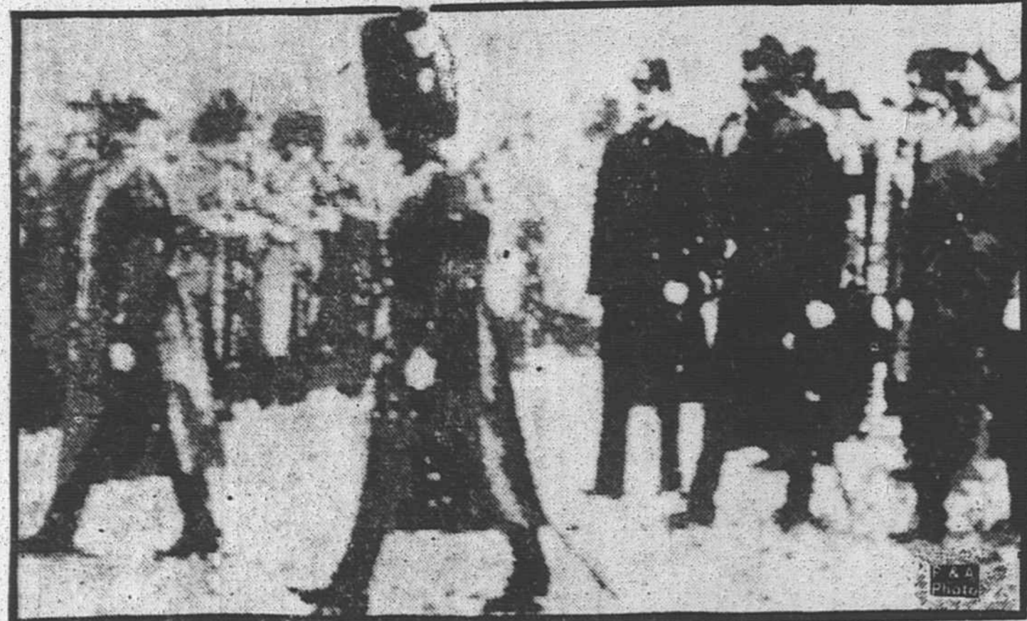
This remarkable photograph was cabled from London to the United States and shows four kings and a crown prince marching behind the casket containing the body of the late Queen Dowager Alexandra as the procession slowly moved over a carpet of snow from St. James palace to Westminster abbey. Left to right: King George of England, prince of Wales, King Christian X of Denmark, King Haakon of Norway and King Albert of Belgium.