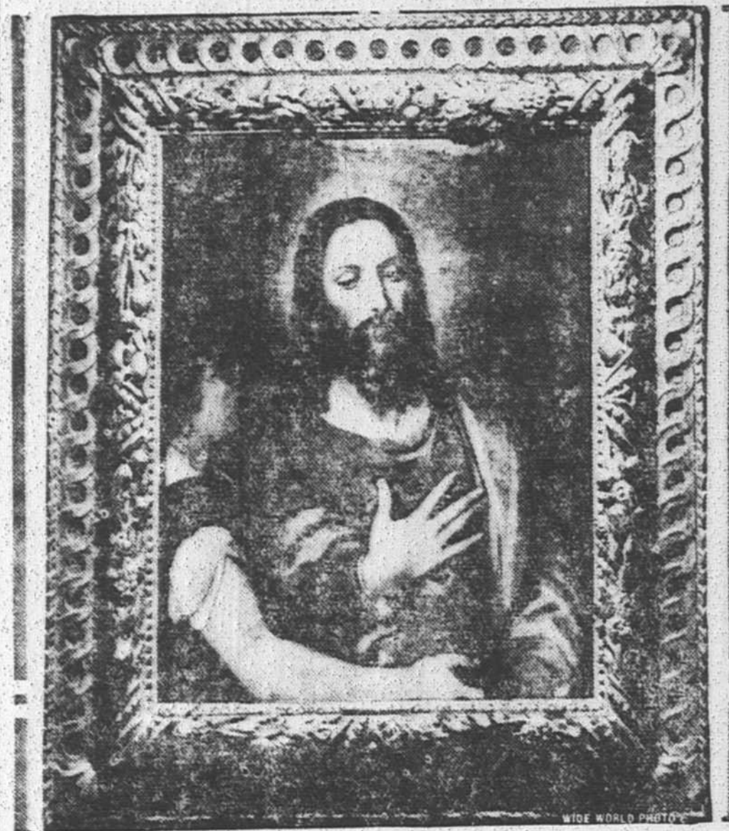
"The Temptation of Christ," considered the best painting in this country by Titian, recently purchased by the Minneapolis Institute of Arts. The purchase price is reported to have been more than $200,000.