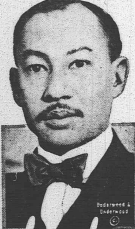
Prince Prajotok of Sukhodaya, who has been proclaimed king of Siam, following the death of King Rama VI, his brother.