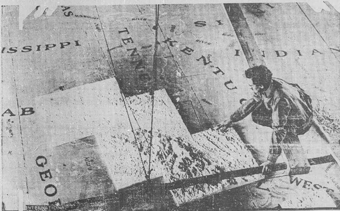
Le Roy Nicho's, map engineer, placing one section of the largest relief map in the world, being constructed in a special map house in Babson Park, near Boston. The map, constructed of special gypsum blocks, will be 63 feet long and 46 feet wide and will follow the curvature of the earth.