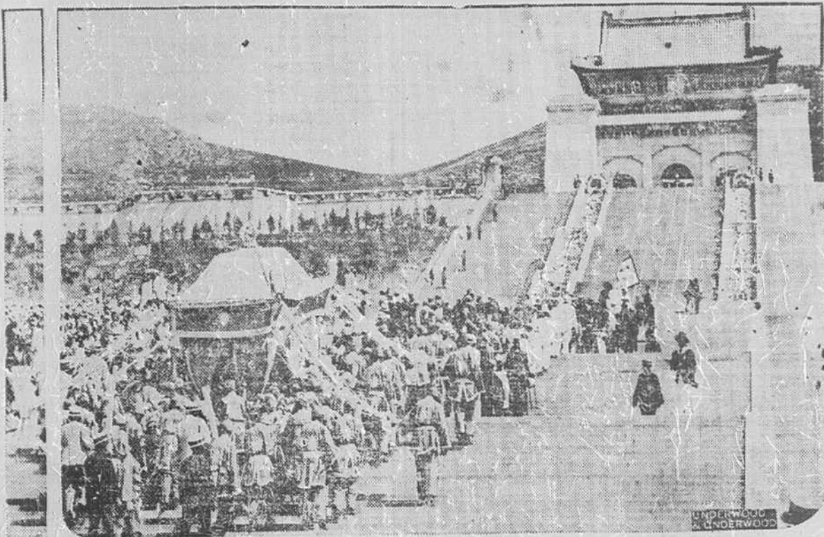
This photograph from Nanking shows the solemn removal of the casket containing the body of Dr. Sun Yat-Sen, hero of Nationalist China, to the recently completed tomb built for the remains of the statesman.