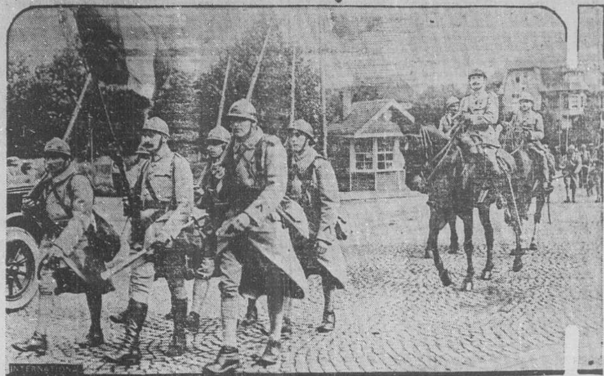
French troops, evacuating the Rhineland, marching out of Coblenz behind the tricolor. Their departure was a great relief to the Germans.