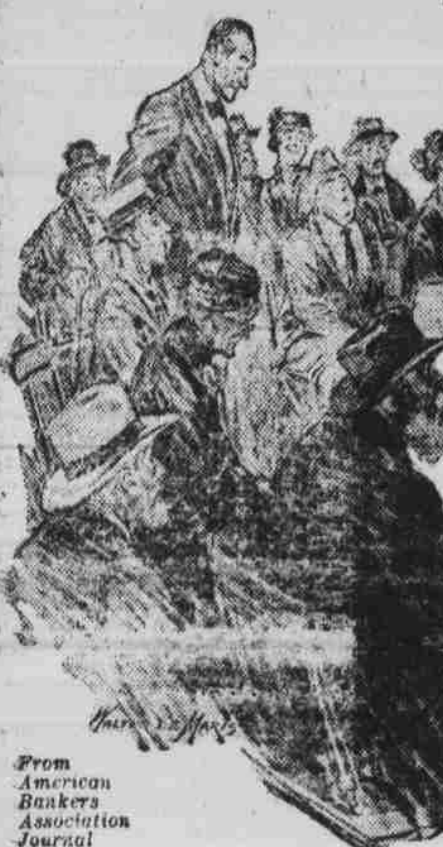
From American Bankers Association Journal

"Wise advertising costs nothing. You have only to increase the sale of your products to the point that covers the advertising charge to enjoy the enlarged business without cost. The natural saving in overhead is extra profit for dividends or for further expansion."