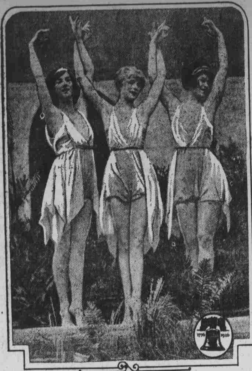
These dancers have selected for their graceful performance the keystone shaped pool in the court yard of the Pennsylvania State Building at the Sesqui-Centennial International Exposition in Philadelphia, which celebrates 150 years of American Independence. The spot is one of the most beautiful and artistic on the exposition site. The Exposition continues until December 1.