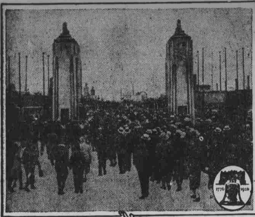
This picture is typical of many such scenes enacted daily at the main gates of the Sesqui-Centennial International Exposition in Philadelphia where the 150th anniversary of the signing of the Declaration of Independence is being celebrated. The "shot" was made from outside the gates and shows the long sweep of historic Broad street, the main artery of the exposition. To the left can be seen one of the capitols of the Palace of Liberal Arts and Manufactures which covers nearly eight acres of grounds and which houses some of the finest exhibits ever seen. The Exposition will continue until December 1.