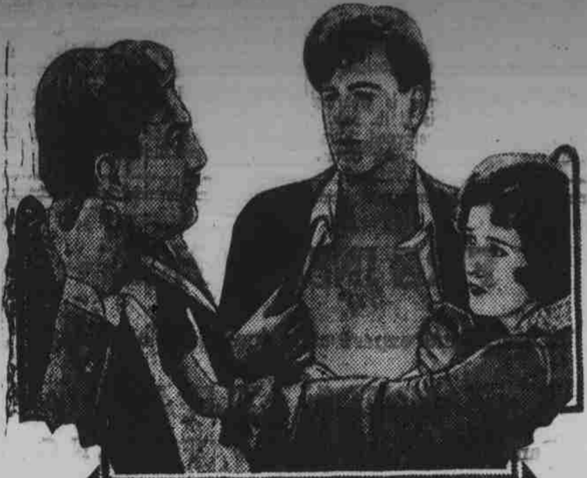
Francis McDonald, Milton Sills and Gertrude Olmsted in "Puppets"