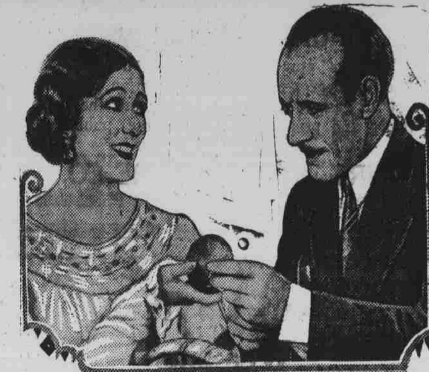
Barbara La Marr and Lewis Stone in "The Girl From Montmartre"