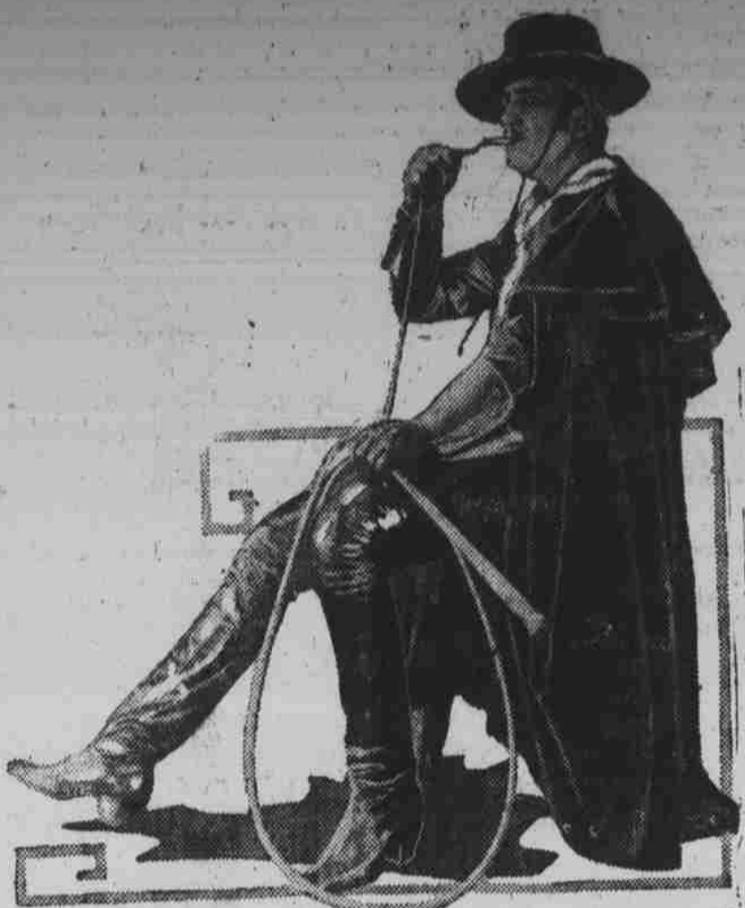
DOUGLAS FAIRBANKS as "DON Q. SON OF ZORRO"