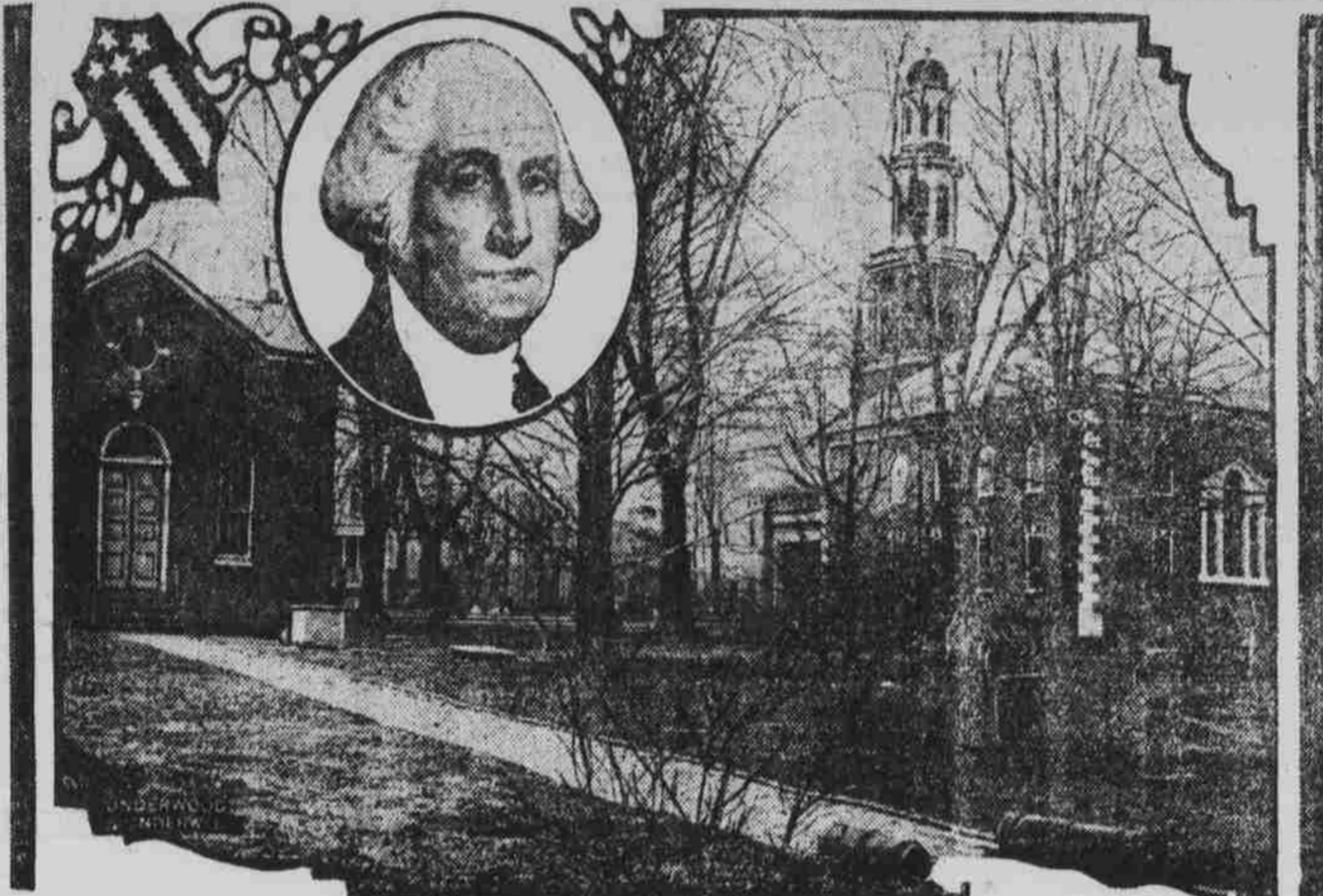
General view of historic Christ church in Alexandria, Va., and the churchyard where many notable figures of Revolutionary times lie buried. On the left is the rectory which through the years has been occupied by many famous Episcopal clergymen. The church was completed in 1773. Washington and Robert E. Lee were among its worshippers, and Washington's funeral services were held here in 1799. In the churchyard are buried contemporaries and friends of Washington, including several who acted as pallbearers at his funeral. The church has a number of relics of Washington's time.

out royal warrant. That land, which they named Transylvania and which included a great part of Tennessee and Kentucky, they had practically proclaimed to be independent not only of Great Britain but of North Carolina, and Virginia as well. They asked, indeed, to have it acknowledged by congress as the fourteenth province of the Confederation.