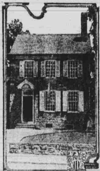
Washington's Headquarters During the Agony at Valley Forge.

"Almighty God, we make our earnest prayer that Thou wilt keep the United States in Thy holy protection; that Thou wilt incline the hearts of the citizens to cultivate a spirit of subordination and obedience to government; and entertain a brotherly affection and love for each other and for their fellow citizens of the United States at large; and finally, that Thou