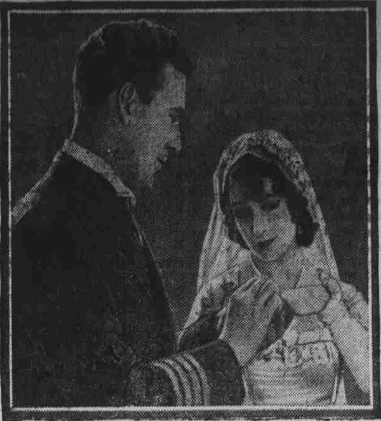
Thomas Meighan and Greta Nissen in the Paramount Picture 'Blind Alleys' A Frank Tuttle Production