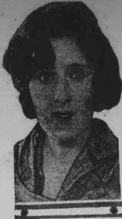
Virginia Browne Faire in 'WHITE FLANNELS' A Warner Bros Production