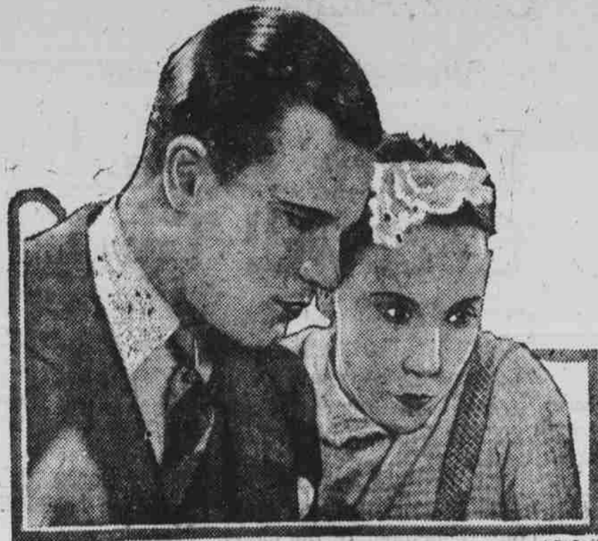
LOUISE FAZENDA in "FINGER PRINTS" A Warner Bros. Production