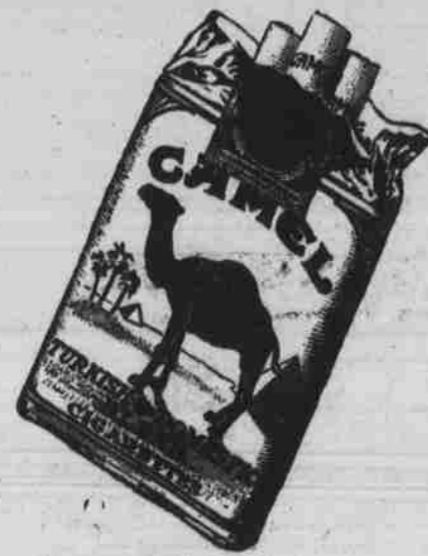
© 1927, R. J. Reynolds Tobacco Company, Winston-Salem, N. C.

If all cigarettes were as good as Camel you wouldn't hear anything about special treatments to make cigarettes good for the throat. Nothing takes the place of choice tobaccos.