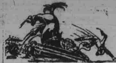
DOWN THE STRETCH with MARIAN NIXON

The lure of the track—the call of speed and sport—flying hoofs—the jockey who starved to win—thrilling drama in every foot of this great race track epic—a picture that'll stay in your memory for months. Great entertainment!