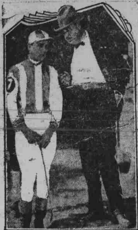
Scene from "DOWN THE STRETCH" A UNIVERSAL JEWEL PRODUCTION with MARIAN NIXON

and Robert Louis Stevenson. Conrad Veidt, the great German character actor, is King Louis XI—his first