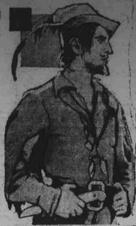
JOHN BARRYMORE in "THE BELOVED ROGUE"

Barrymore is Villon, the heart-and-jail-breaking idol of the underworld of Paris, the crackling personality that inspired the pens of Swinburne