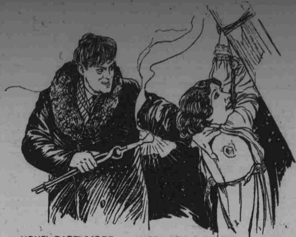
LIONEL BARRYMORE and AILEEN PRINGLE in "BODY AND SOUL"