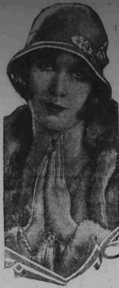
ESTHER RALSTON IN THE PARAMOUNT PICTURE "LOVE AND LEARN"

next hog sale will be held on April 25th. He states that hog raisers have indicated that they will have a sufficient number of hogs on hand to make a carload.