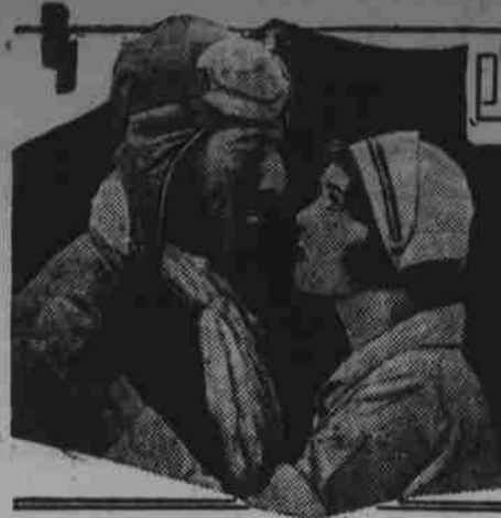
JACK HOLT, LILA LEE in "FLIGHT" A COLUMBIA PRODUCTION

Johnson's Prepared Wax will preserve your floors, and will give them a finish that will make a fitting background for your furniture and rugs. You'll find it at the Macon County Supply Co. on the Bargain Counter. —Adv. Itc