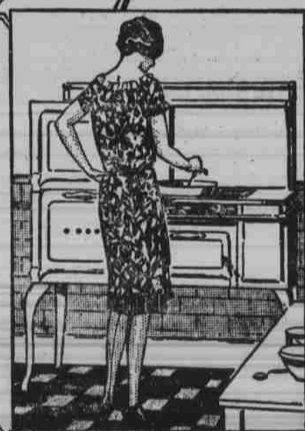
Modern Gas Range