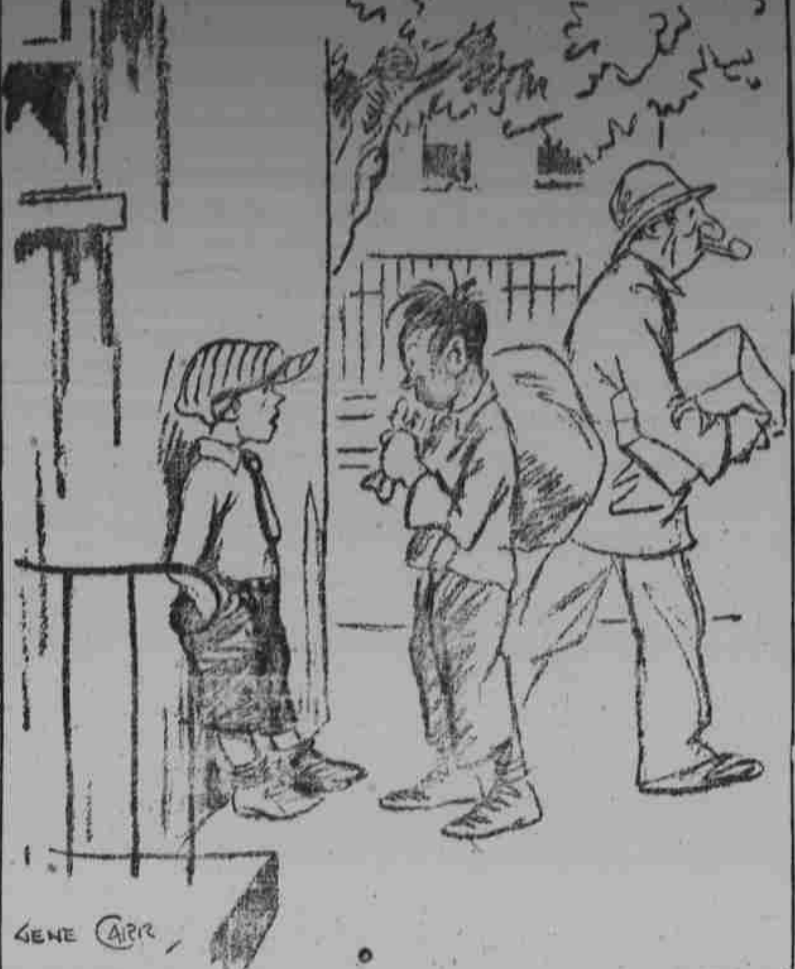
"Gosh, Ya Lucky Workin' in th' Coal Game. People Won't Never Notice When Ya Face is Dirty."