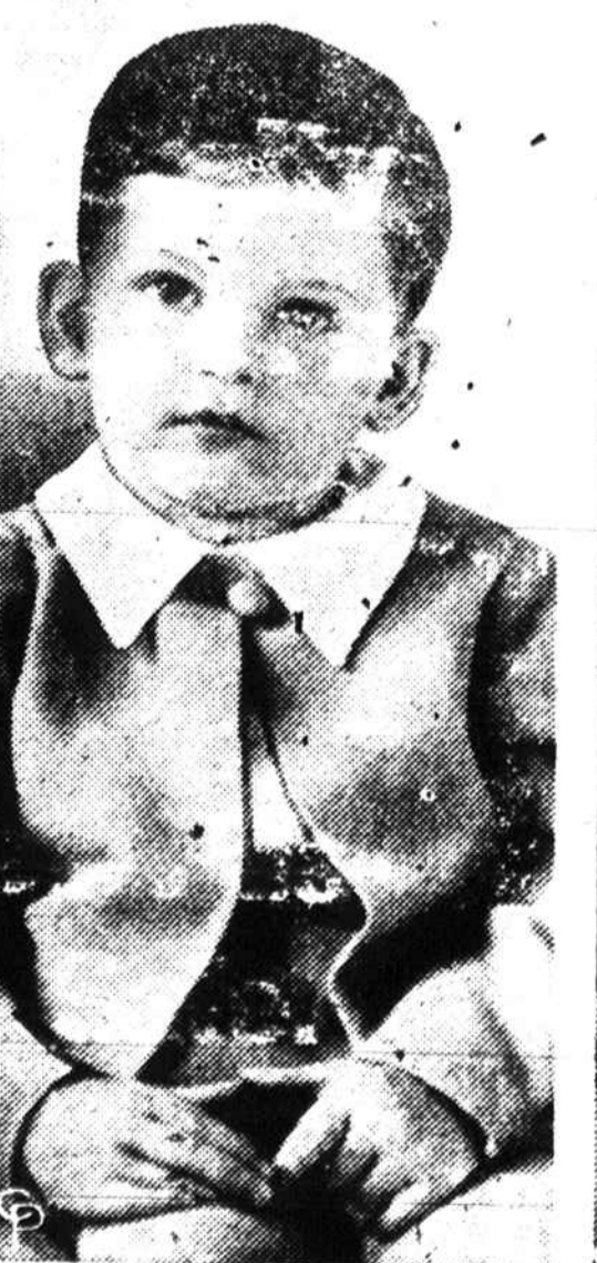
CROWN PRINCE SIMEON , 6, ascends the throne of Bulgaria as King Simeon II, succeeding his father, King Boris III, 49, who died under mysterious circumstances. The control of the country was placed in the hands of a council which will name a Regent to act for the young ruler.