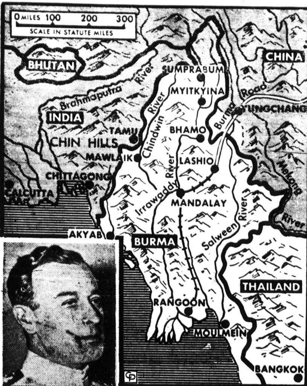
NAMED SUPREME COMMANDER of the Allied Southeast Asia area, Lord Louis Mountbatten (inset), cousin of King George and leader of Britain's famed Commandos, will probably strike through Japanese-occupied Burma when the Asiatic campaign opens. Map shows the area. Shaded territory is still held by the Allies.