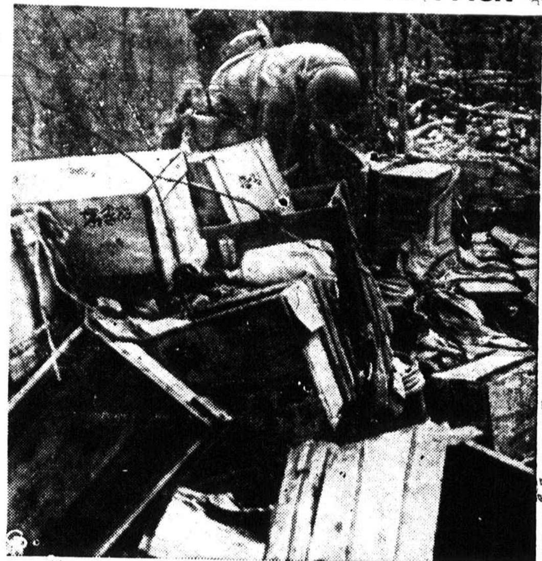
SO QUICKLY did the Japs evacuate Munda, New Georgia, when our troops closed in on them, they didn't have a chance to destroy supplies. Here a U. S. soldier examines some of the material left on the air field, which is now being used by American planes.