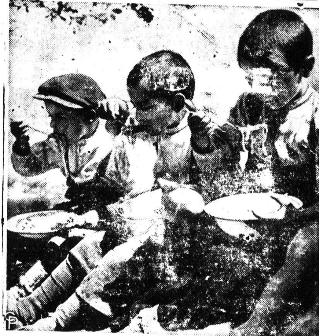
ABOUT THE HAPPIEST PERSONS in Sicily are these three lads, seen enjoying one of their favorite foods, macaroni, which had virtually disappeared from Sicilian kitchens during the period the island was held by the Axis. Their meals will be regular now.