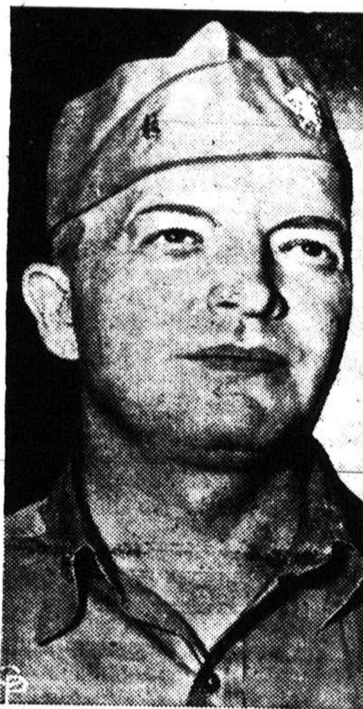
LIEUT. COMM. Harold Stassen, former governor of Minnesota, is pictured just after he had been made flag secretary to Admiral William F. Halsey, Commander of the South Pacific Force.