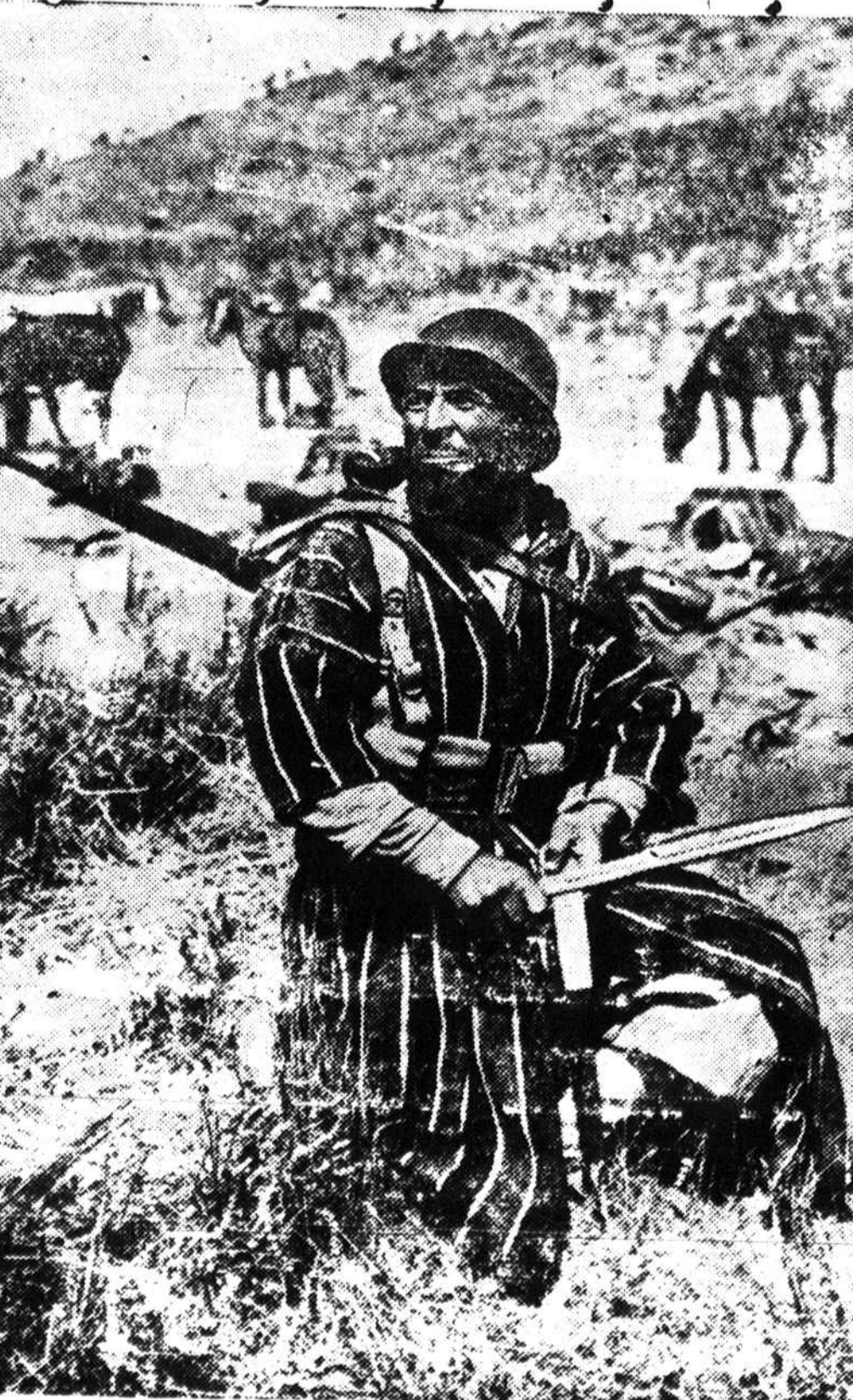
BAD NEWS FOR THE AXIS is this fierce-looking Goumier, one of many fighters from North Africa who fought valiantly alongside American troops in the Sicilian campaign. Their favorite weapon is a knife, with a razor, sharp bayonet second choice. (International)