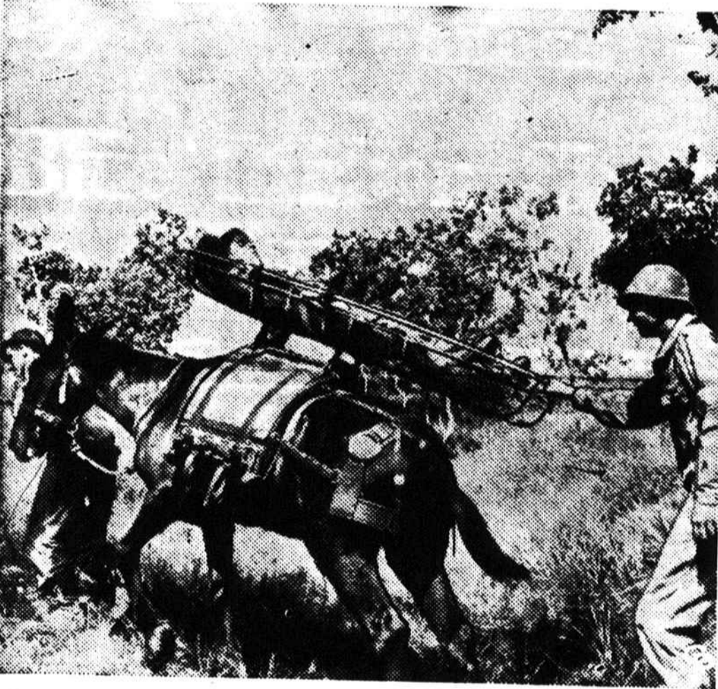
DESPITE MECHANIZATION , sure-footed mules still perform chores for the U. S. Army when troops march into terrain unsuitable for the operation of trucks. Members of an artillery unit in New Guinea are shown above testing a new type of litter to be used for transporting men wounded in mountain fighting.