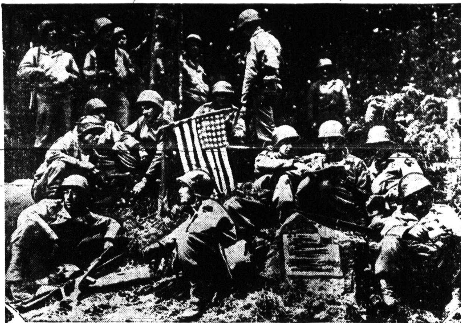
BATTLE WEARY U. S. troops, among the first to fight their way to German soil, tie the Old Glory to a post in the Aachen Stadt Forest where they have slumped to the ground for a rest.