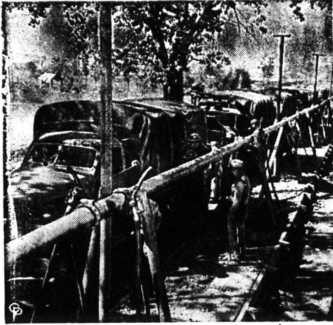
HERE'S A SCENE that should make an "A" motorist green with envy. Trucks making up the first convoy to run over the recently completed Ledo-Burma road, now called the Stilwell Road, fill up with precious gas at a station along the way. Gas-thirsty motorists will note that there are no meters to gauge the gallons poured.

return cannot be made. Also have a list of all income received from rents, dividends, interest, sales or any other source as well as business so that your return can be compiled without undue delay. Fill out as much of the form as possible, print your name and address on your return and have your dependents listed.