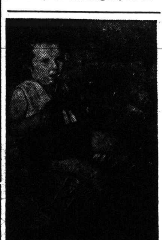
A WIDE-EYED Dutch child brought in her woolen sweater contributed in the American spring clothing drive. Millions of others have had something new for years. Give clothing to the Victory Clothing Collection.