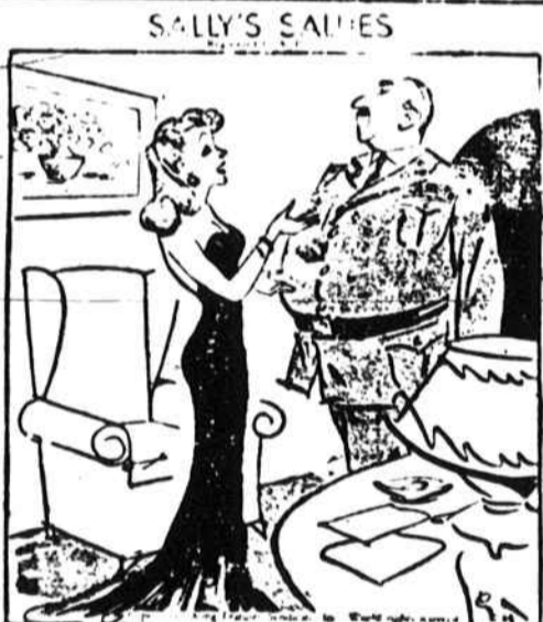
"You were lucky being stationed in China, General. Who does your laundry now?"

"The greatest affliction in the world today is food scarcity"—N. E. Dodd, Undersecretary of Agriculture.