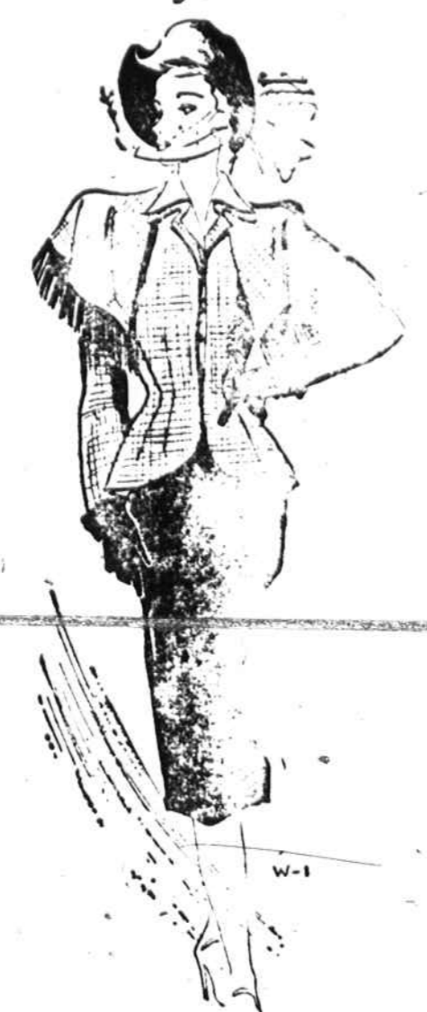
Jacket with fringe trimming.