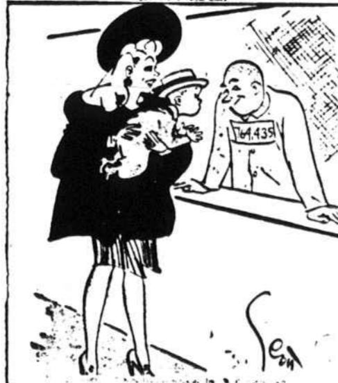
"Maybe they'll nickname him 765435 after you and your numbers racket!"