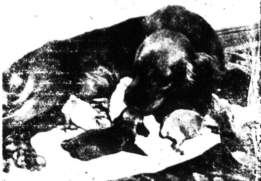
CHEATA, A COCKER SPANIEL, nurses her four puppies and three orphaned pekinese waifs. Cheata, herself, was nursed by an "adopted" mother when she was a pup. The three newcomers are now out of danger and thriving with their newly "adopted" mother.