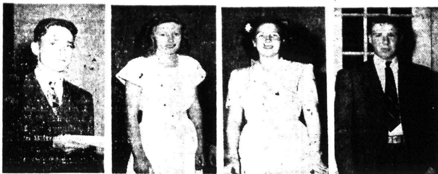
ESSAY CONTEST FINALISTS —The four district winners in the Cooperative Essay Contest who will compete in the State Finals to be held at the Womans Club in Raleigh on June 26 are shown above.

was going on, but there is little evidence that such praying is being done now. My friends, let us pray without ceasing in our homes with our children, in our churches, and as we go away from place to place, that the hearts and minds of our people may be turned from the sinful ways of the world to the things of righteousness and to God. O, let us pray in the Spirit of God.