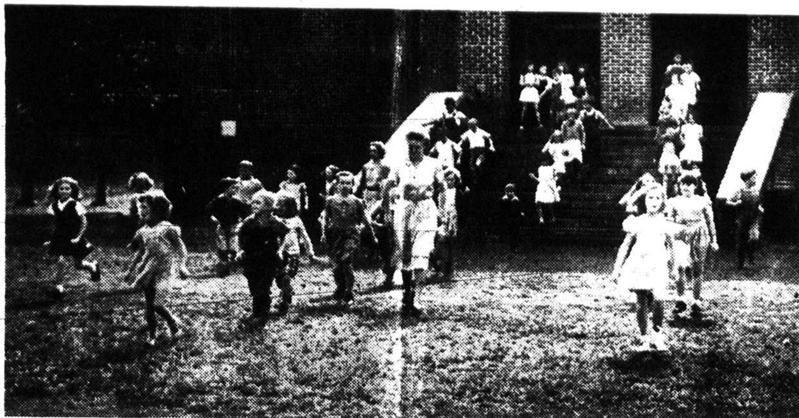
The above picture show the children as they filed out of the building of the Sylva Elementary school last Thursday morning in connection with the State-wide school fire drill in observing National Fire Prevention Week. The several hundred students cleared the two-story building in less than one minute