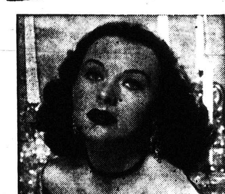
MEDY LAMARR, glamorous Hollywood star, predicts fashion stardom for all the winners in the Gold Cross Shoe Hollywood Fashion Poll. "They have," says Miss LaMarr, "the grace, the simple elegance, that are so much a part of the 'pretty lady' picture, this season."